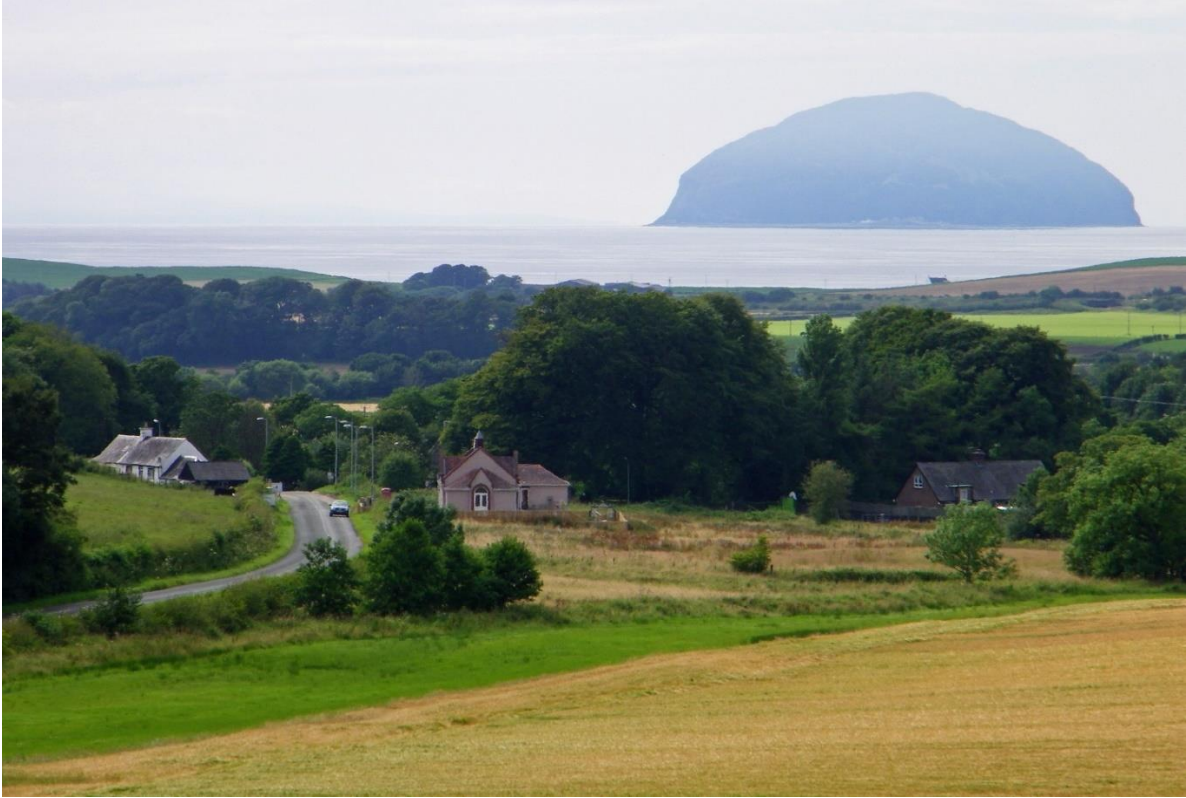
My favorite photo of Old Dailly. The white building on the left is the Smithy.