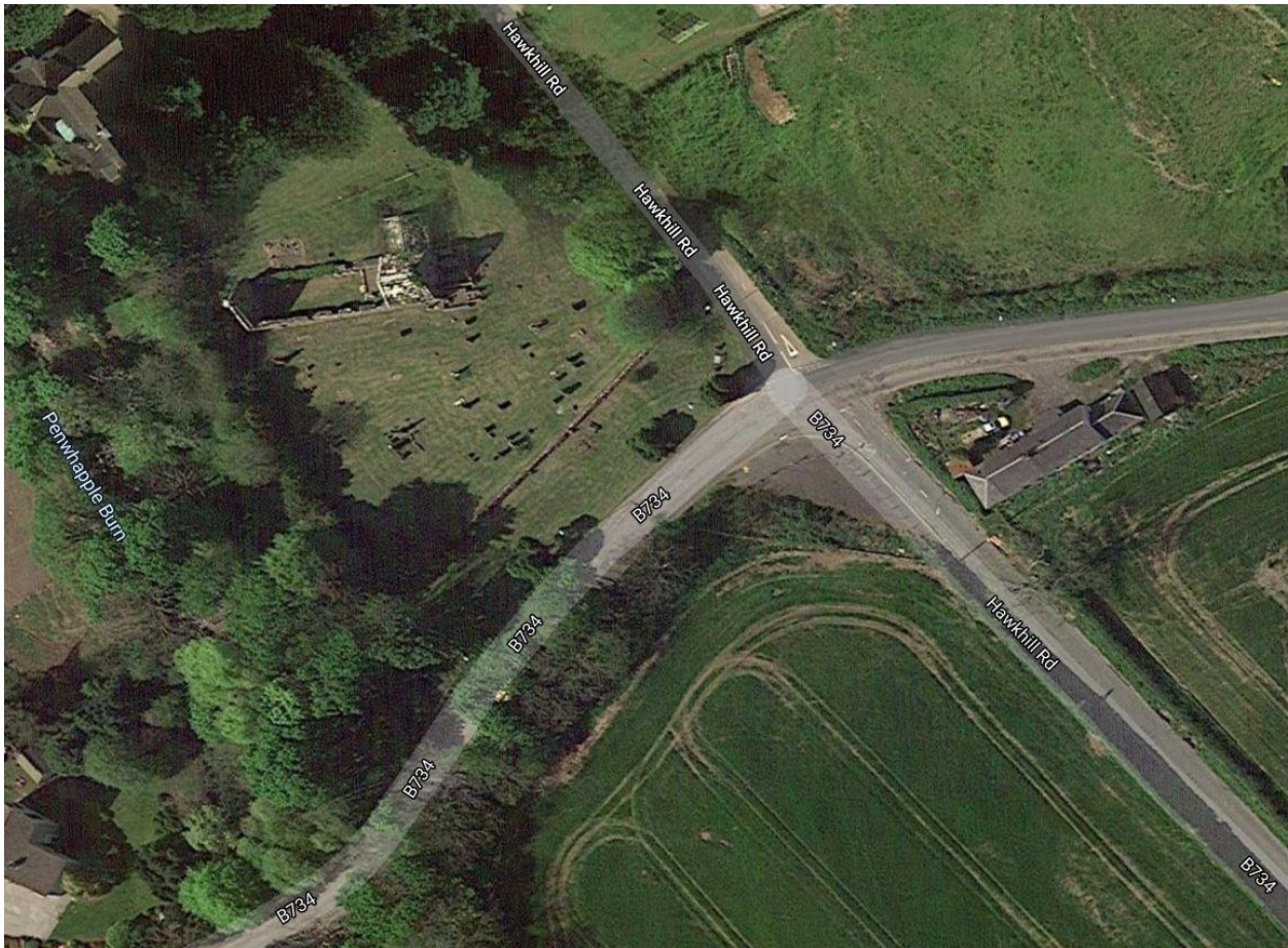
This Google Satellite image of Old Dailly includes the ruins of the Old Dailly Church and the Smithy on the corner opposite the church.