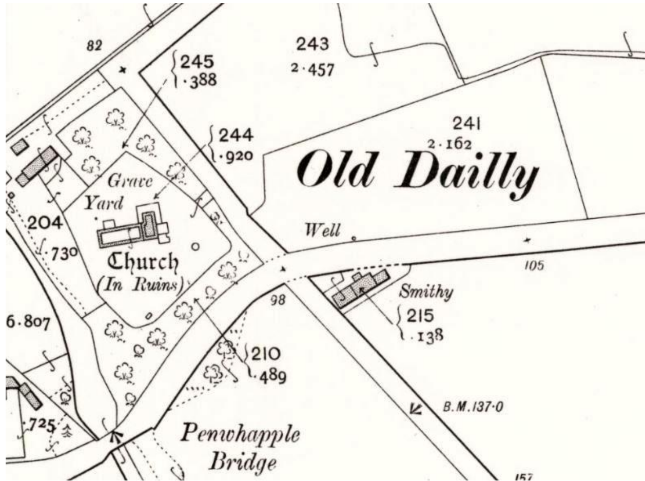
This 1907 map shows that a covered front entryway had been added onto the Smithy.