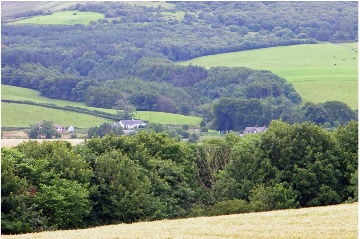
Old Dailly and the Smithy from a nearby hill