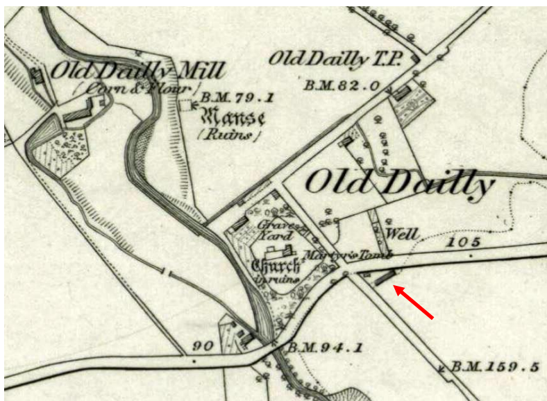
This 1856 map shows the scattering of buildings that survived at Old Dailly, including the unmarked Smithy on the corner opposite the church ruins.